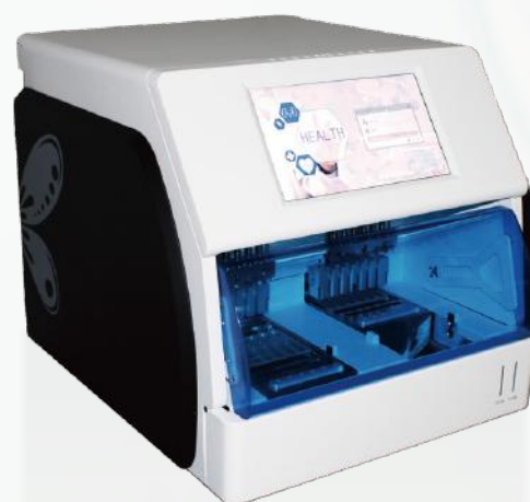
MQ 60 proB