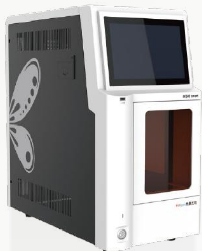
MQ 60 smart